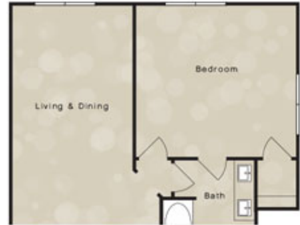
A5C | 934 Sq Ft