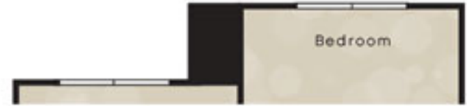
A5A | 699 Sq Ft