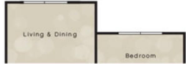
A5B | 801 Sq Ft