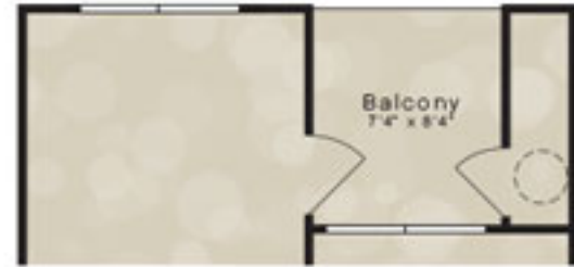
A3B | 651 Sq Ft