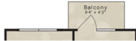
A3F | 559 Sq Ft