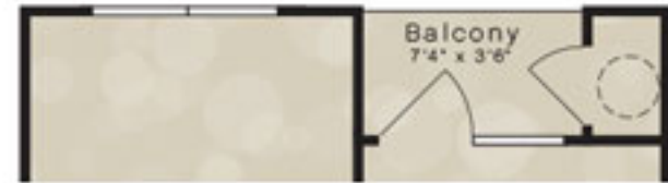
A3G | 605 Sq Ft